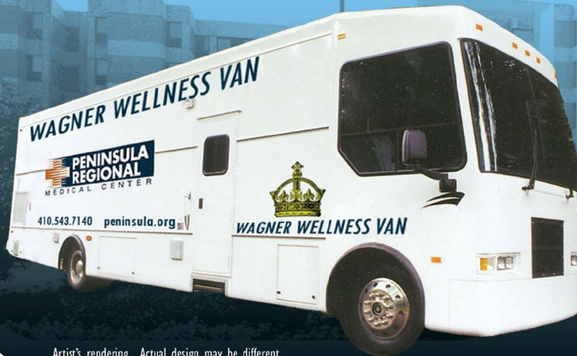
Artist's rendering. Actual design may be different.

The van will also provide respiratory clearance physicals for many volunteer fire companies.